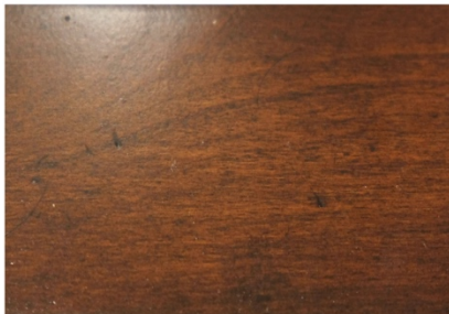
SMOOTH / NO DISTRESS